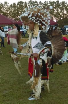
Saddletree Pow Wow Dancer